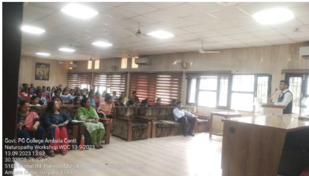
Govt. PG College Ambala Cantt Naturopathy Workshop WDC 13-9-2023 13.09.2023 13:02 30.33808, 76.83697 5183, Nishat Rd, Palledar Mohalla, Mochi Mandi, Sadar Bazar, Ambala Sadar, Haryana 133001