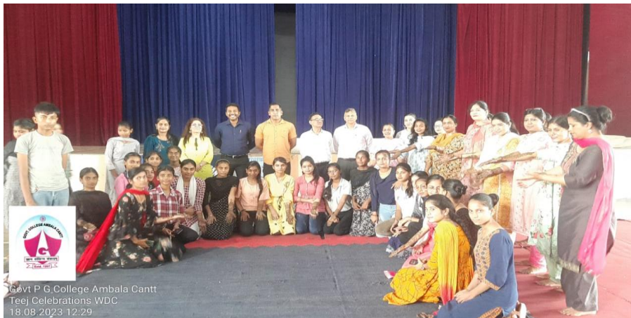
Govt P G College Ambala Cantt Teej Celebrations WDC 18.08.2023 12:29