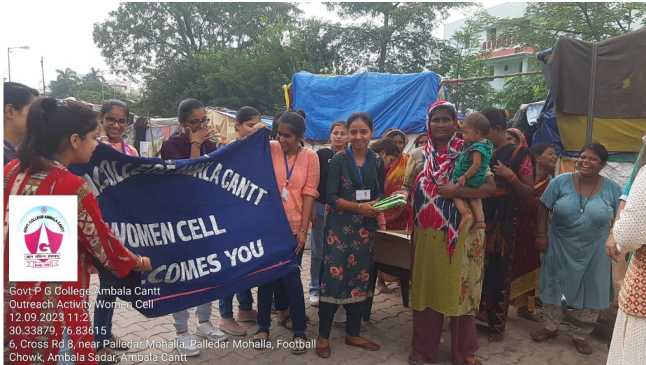
Govt. P G College, Ambala Cantt Outreach Activity Women Cell 12.09.2023 11:27 30.33879, 76.83615 6, Cross Rd 8, near Palledar Mohalla, Palledar Mohalla, Football Chowk, Ambala Sadar, Ambala Cantt