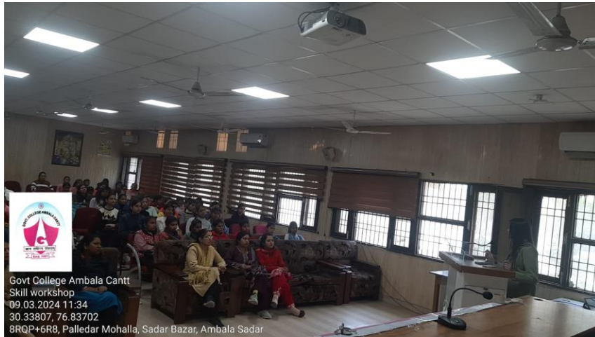
Govt College Ambala Cantt Skill workshop 09.03.2024 11:34 30.33807, 76.83702 8RQP+6R8, Palledar Mohalla, Sadar Bazar, Ambala Sadar