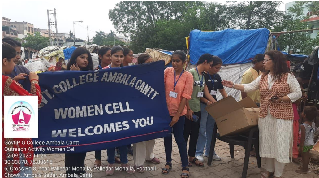
Govt P G College Ambala Cantt Outreach Activity Women Cell 12.09.2023 11:26 30.33878, 76.83615 6, Cross Rd 8, near Palledar Mohalla, Palledar Mohalla, Football Chowk, Ambala Sadar, Ambala Cantt