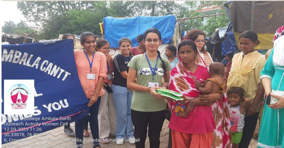
Govt P.G. College Ambala Cantt Outreach Activity Women Cell 12.09.2023 11:26 30.33878, 76.83835 6, Cross, RKS near Palledar Mohalla, Palledar Mohalla Football Ground, Ambala Sadar, Ambala Cantt