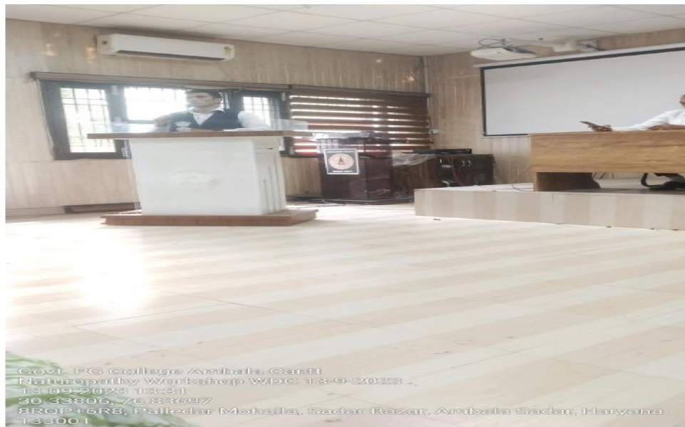
Govt. PG College Ambala Cantt Naturopathy Workshop WDC 13-9-2023 13.09.2023 13:31 30.33806, 76.83697 8R0P46R8, Palledar Mohalla, Sadar Bazar, Ambala Sadar, Haryana 133001