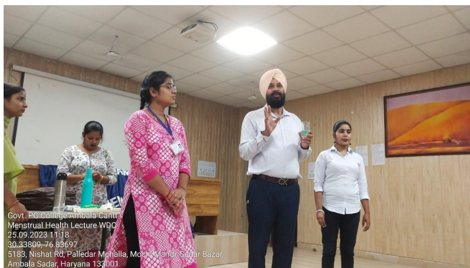
Govt. PG College Ambala Cantt Menstrual Health Lecture WDC 25.09.2023 11:18 30.33809, 76.83697 5183, Nishat Rd, Palledar Mohalla, Mochi Mandi, Sadar Bazar, Ambala Sadar, Haryana 133001