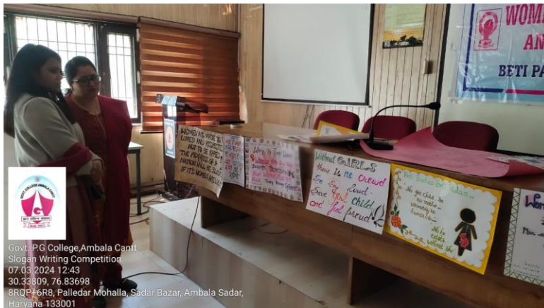
Govt PG College Ambala Cantt Slogan Writing Competition 07.03.2024 12:43 30.33809, 76.83698 8RQP+6R8, Palledar Mohalla, Sadar Bazar, Ambala Sadar, Haryana 133001