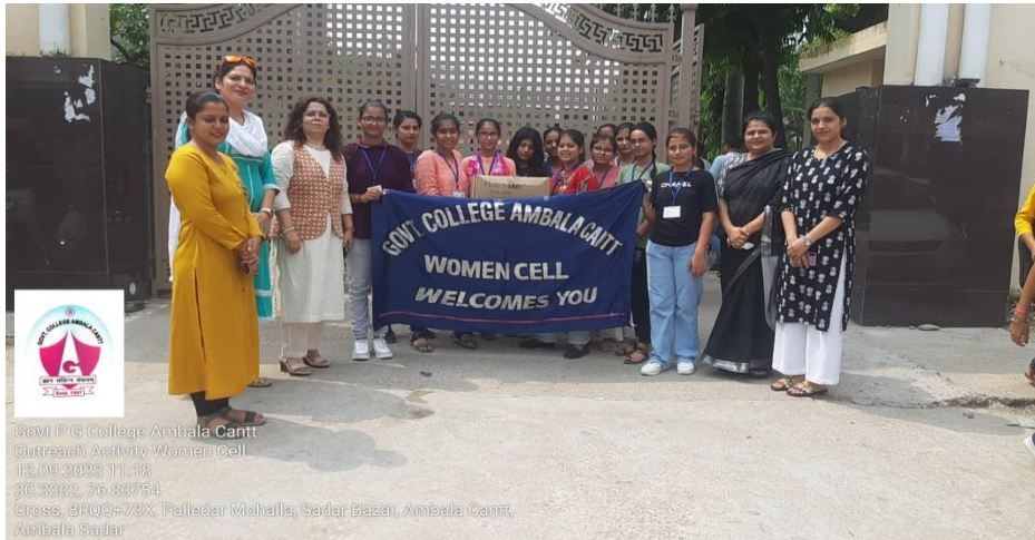
Govt P.G. College Ambala Cantt Outreach Activity Women Cell 12.09.2023 11:13 30.3382, 76.83754 Cross, BROD-73X, Palledar Mohalla, Sadar Bazar, Ambala Cantt, Ambala Sadar