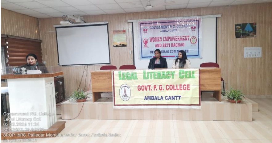
Government P.G. College Legal Literacy Cell 03162-2024 11 24 3033607, 3668702 8RQP+6R8, Palledar Mohalla, Sadar Bazar, Ambala Sadar, Haryana 138001